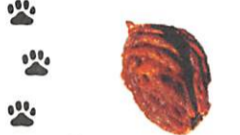
Peach & Plum pits