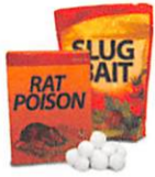
Moth balls, Rat/mouse poison, Some slug baits