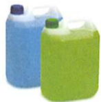
Windshield washer fluid & Antifreeze