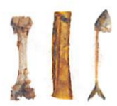
Chicken, Rib & Fish bones