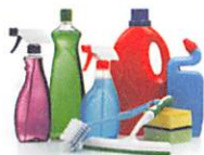
Household cleaning products