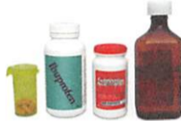
Prescription drugs, Ibuprofen, Acetaminophen, & Cold medicine