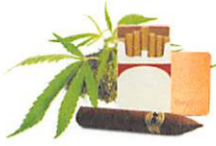
Tobacco products, Nicotine patch & Marijuana