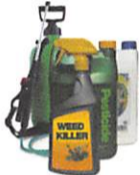
Some insecticide products