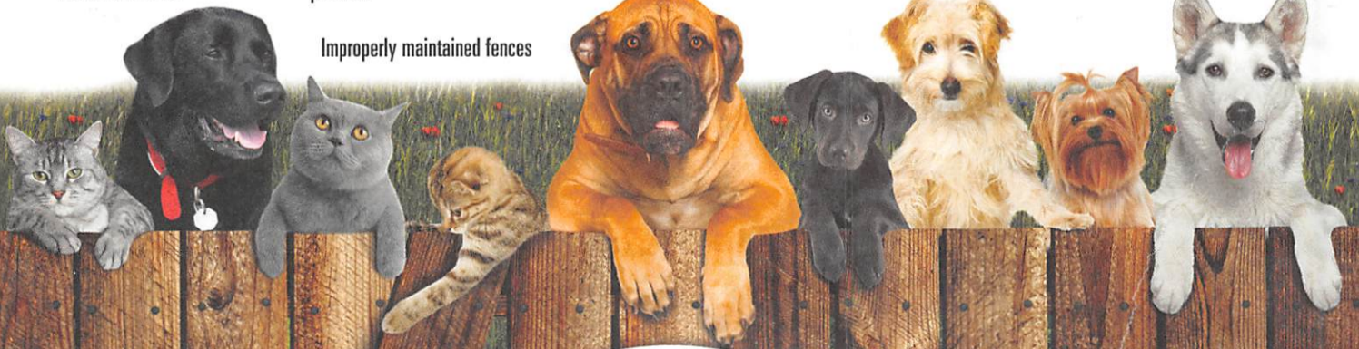
Improperly maintained fences