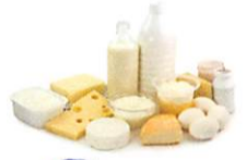
Raw eggs, Milk & Other dairy products